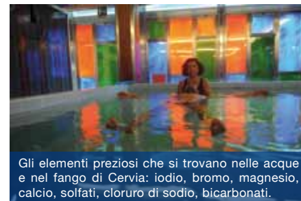
Gli elementi preziosi che si trovano nelle acque e nel fango di Cervia: iodio, bromo, magnesio, calcio, solfati, cloruro di sodio, bicarbonati.

> Recommended for: phlebitis, post-operative rehabilitation and venous diseases.